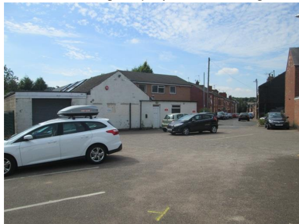
View of existing employment building.