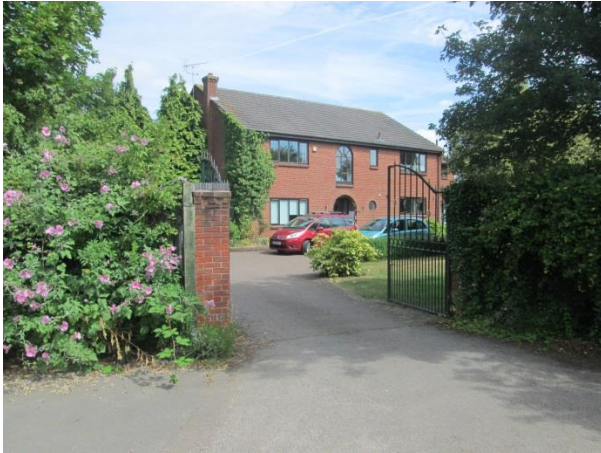
View of Park House