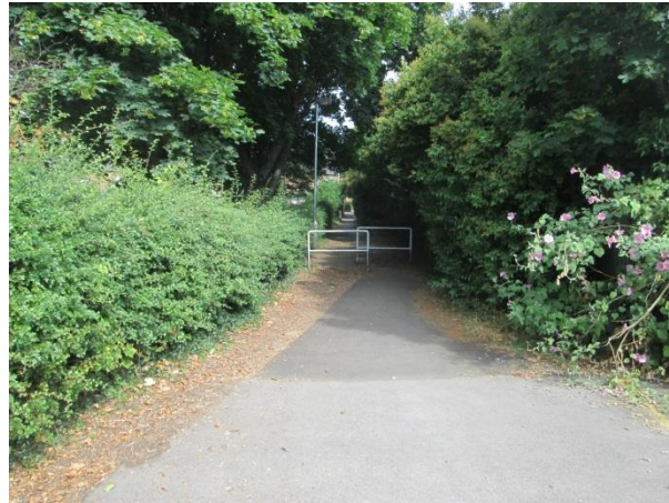
Existing footpath entrance/exit from outside Park House.