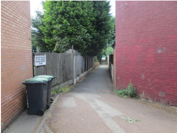
Existing footpath entrance/exit from Noel Street.