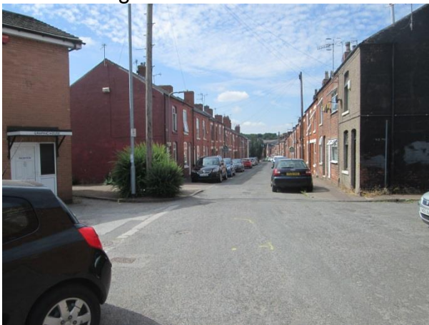
View looking down Noel Street.