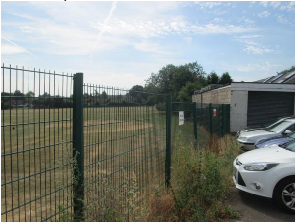
Rear boundary with adjacent Kimberley School.